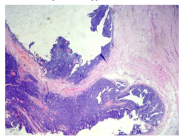
Fig 3: Cystic mass showing malignant round cells in Ewing's/PNET (H&E stain, x100).

Case 2: Another 35-year-female was having 4 months of amenorrhoea and left sided cystic and solid thigh mass measuring 16 x 11 x 4cm. Due to such a huge mass on inner aspect of left thigh, patient was having difficulty while walking and pain as it was rubbing the other parts. Patient was confirmed pregnant by pregnancy tests and USG. Patient was referred for fine needle aspiration cytology (FNAC) of that thigh mass. On FNA, it was diagnosed as malignant small round cell tumor. Report was communicated to treating surgeons and discussion with patient and relatives were made. They finally excised that left thigh mass. We received whole skin covered excised mass measuring16x11x4 cm. On sectioning it was having cystic and solid grayish white areas. Areas of cystic degeneration and necrosis were also present. Representative sections were examined and it was morphologically consistent with malignant round cell tumor with malignant round cells in diffuse sheets with cystic areas [Figure 3]. Relavent IHC panel was applied.