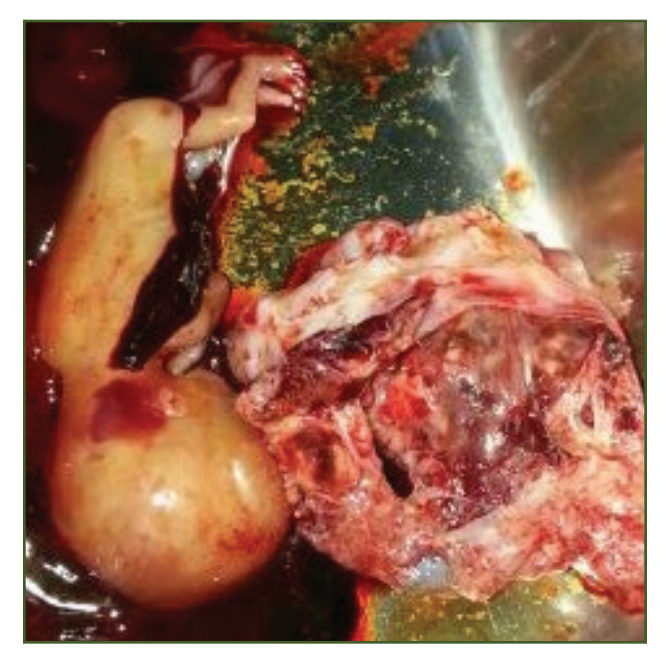
Fig. 2: 14 weeks fetus with placenta

The incidence of ectopic pregnancies varies from 10-39.5/1000 deliveries. [2,3,4]. Ectopic Pregnancy is the leading cause of first trimester pregnancy related morbidity and mortality (38 deaths/100,000 events). [8] The ampullary portion of the fallopian tube is the most common location. Bouyer et al reported [5] the site of ectopic pregnancy from a 10 year population based study of 1800 cases. They found