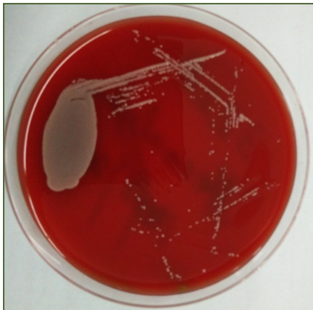
Fig. 1: The growth on Sheep blood agar were smooth, moist grayish white, non hemolytic colonies.

Serum electrolytes, Urea and Creatinine were normal. Routine urine showed 8-10RBC /hpf and 10-15 WBCs /hpf