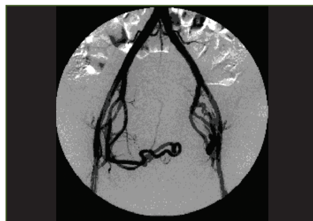
Fig. 2: Uterine Artery Angiogram