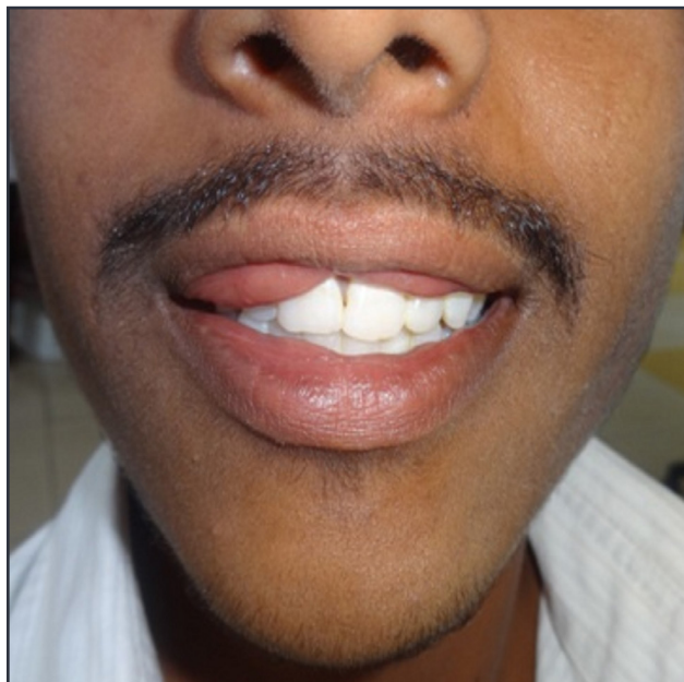
Fig. 2: Prominent extra fold of lip on smiling.

The congenital form of double lip is thought to arise during the second or third month of gestation from a persistence of the sulcus between the Pars Glabrosa and the Pars Villosa of the lip. During fetal development, the upper lip mucosa consists of two transverse zones, an outer zone, which is smooth and similar to skin, the Pars Glabrosa and the inner zone, which is villous and similar to the oral mucosa, the Pars Villosa.[6] Clinically on smiling, it gives the characteristic Cupid's bow appearance. Double lip can be distinguished from other lip swellings due to this particular "Cupid's bow" appearance or midline constriction due to upper labial frenum attachment.