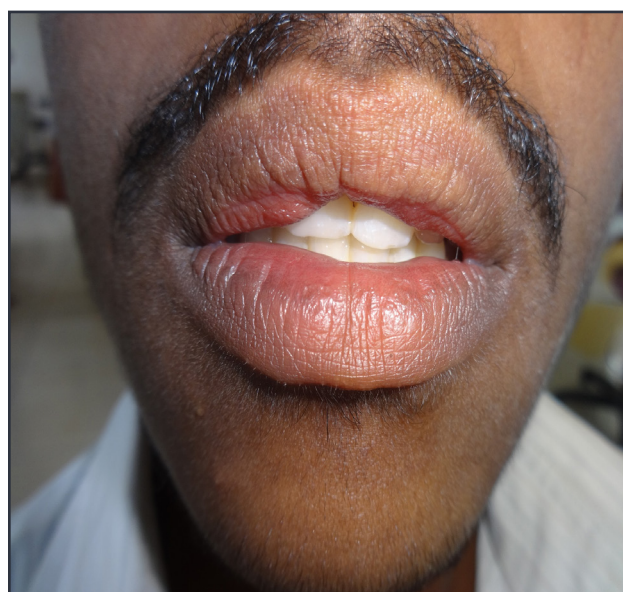
Fig. 1: Extra fold of redundant tissue seen on the inner surface of the upper lip bilaterally.

The double lip may be present as a single entity or as a feature of syndrome. The exact cause is unknown but may be transmitted as an autosomal dominant disorder. The association of congenital double lip with other abnormalities as bifid uvula and cleft palate has been described.[5]