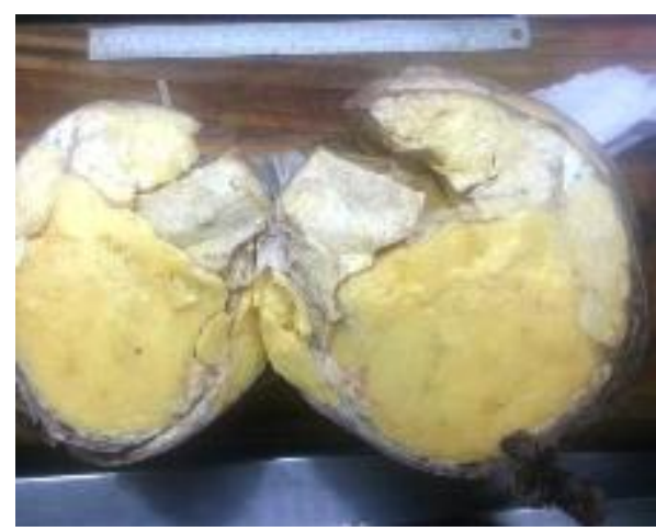
Figure 1: Gross examination of uterine lipoleiomyoma showing yellowish cut surface with focal grey white area showing whorling.

All the standard serological and hematological investigations and metastatic workup was done and the parameters were within normal range. The patient underwent total abdominal hysterectomy with bilateral salpingo-oophorectomy. Per-operative examination revealed large uterine mass approximately 25 cm in diameter with unremarkable cervix and bilateral adnexa. There was absence of free fluid or abdomino-pelvic deposits.