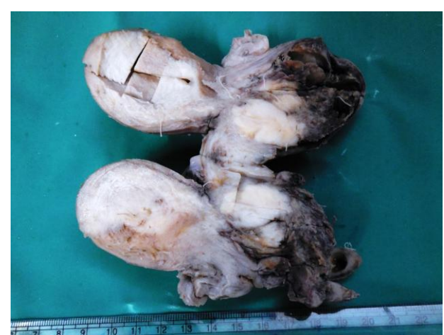
Figure 2: On serial cut sections, mass showed pale yellow to gray-brownish areas and soft to firm in consistency.

Microscopically, the sections from the cervical tumor showed mixture of bland, spindle-shaped smooth muscle cells in whorled pattern with scattered mature adipocytes (Figure 3,4). Cytological atypia, necrosis, and calcification were not seen. Sections from endometrium, cervix and right fallopian tube were unremarkable and right ovary showed corpus albicans. On histopathological findings, the tumor was diagnosed as a benign cervical lipoleiomyoma.