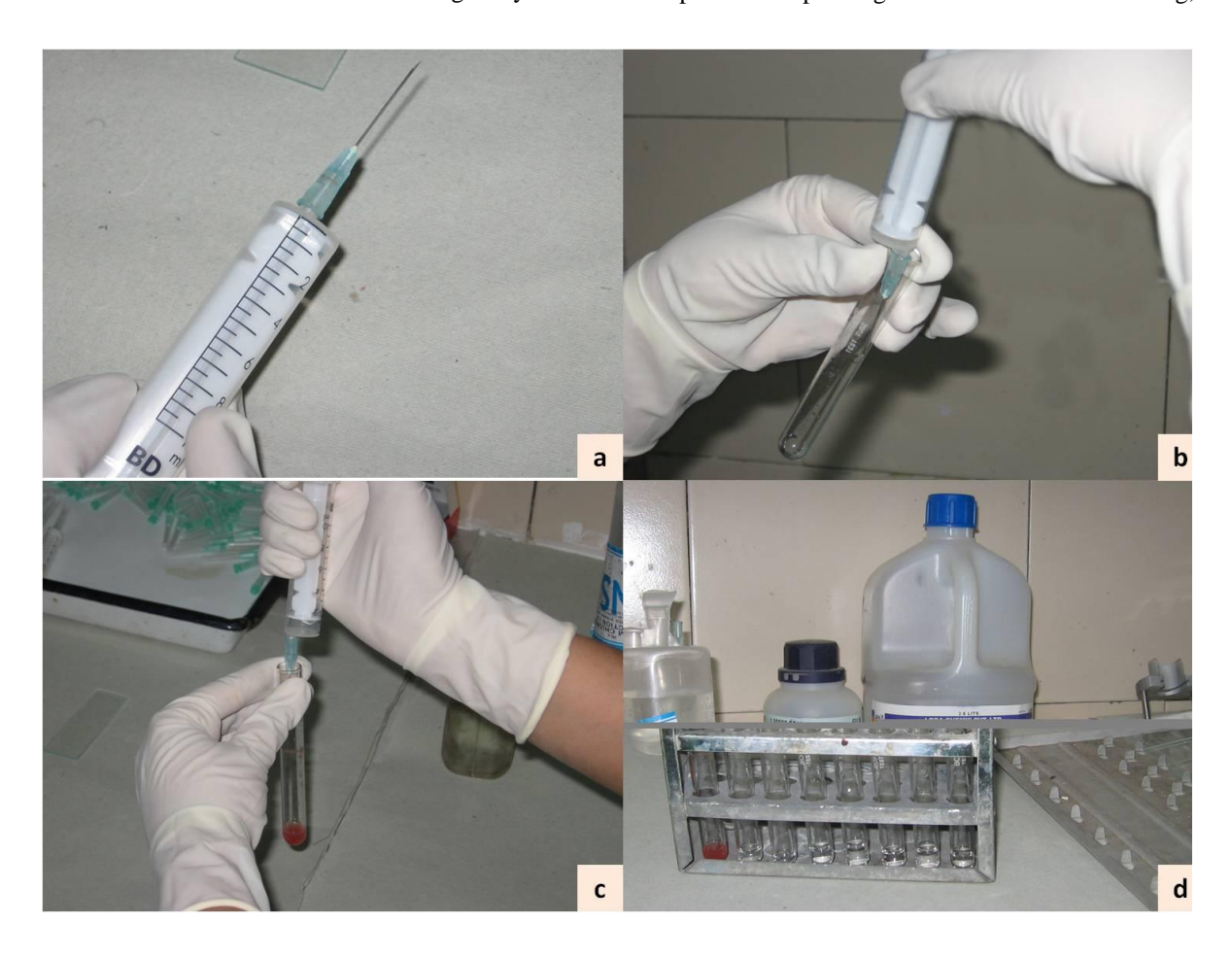
Figure 1 Photograph showing the procedure of preparation of smears from residual material. Needle hub showing the residual material (a), which is dispensed into a tube containing normal saline (b). The hub is thoroughly rinsed with saline (c). The material is ready for cyto-centrifugation.

This prospective study included 100 consecutive cases of fine needle aspiration (FNA) performed on an out-patient basis at a tertiary center. FNA was performed either with or without suction with 20 ml syringe and 22/23G needle, according to the site of aspiration. Depending on the nature of the swelling,