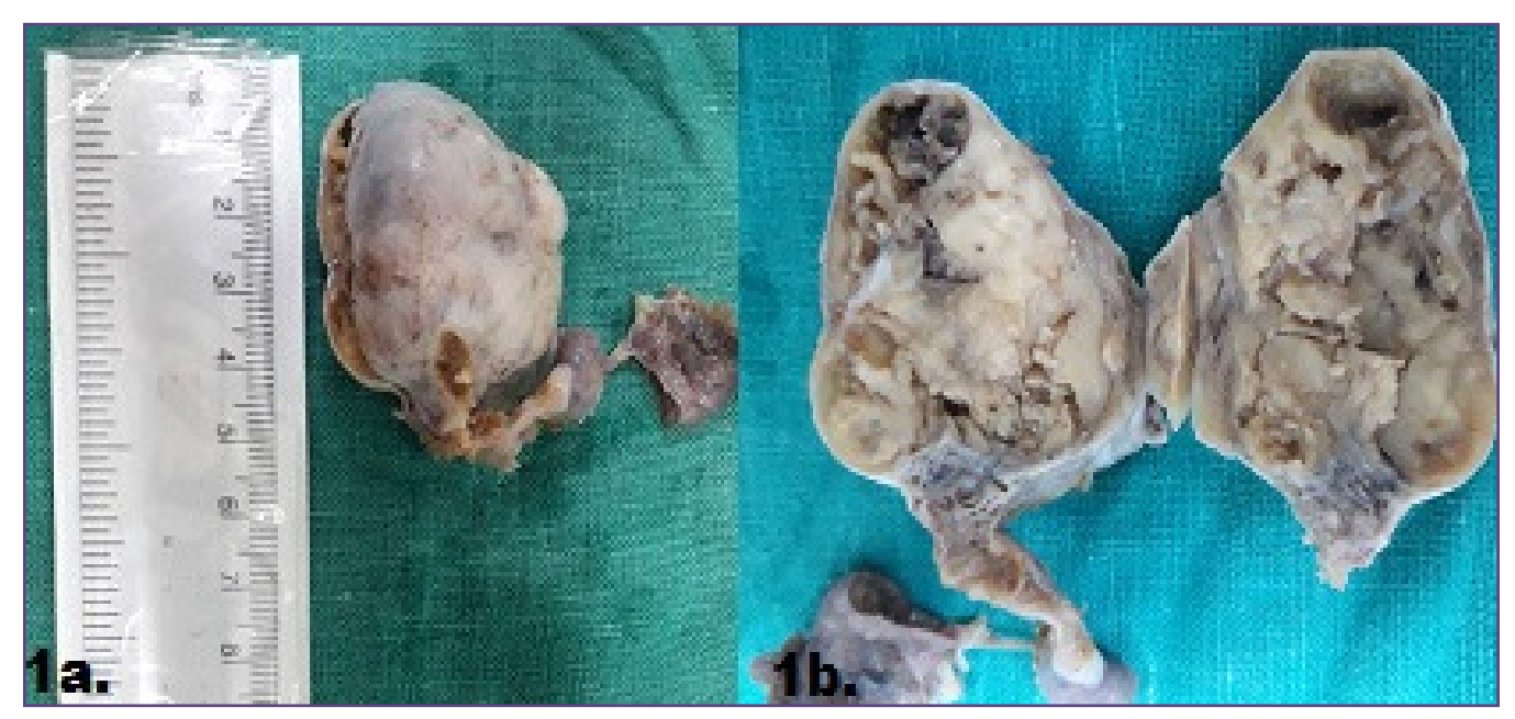
Fig. 1: Gross left ovary (a)Outer surface is smooth. (b). Cut surface showed a cyst measuring 1.5cm in diameter.