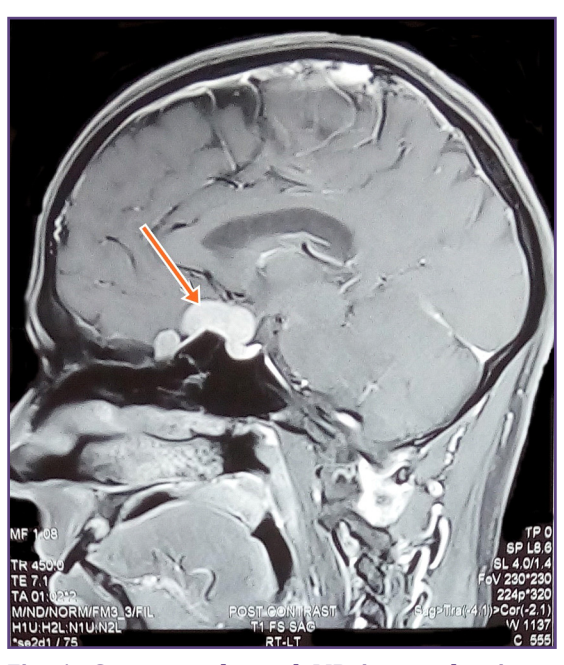
Fig. 1: Contrast-enhanced MR image showing a homogeneously enhanced suprasellar mass as indicated by arrow.