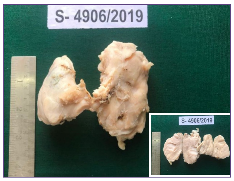
Fig. 1: Total thyroidectomy specimen, right lobe measuring 4x3.5x2 cm, left lobe measuring 7x4x 3.5cms and isthmus measuring 1.5x0.5 cm. Cut section of all the lobes was solid, fleshy and grey white.