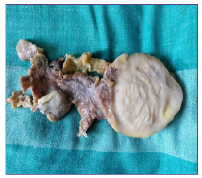
Fig. 2: Gross showed a well encapsulated nodular soft tissue mass measuring 8x7.5x 2.3 cm. Cut section showed soft to firm grey white to yellowish areas.