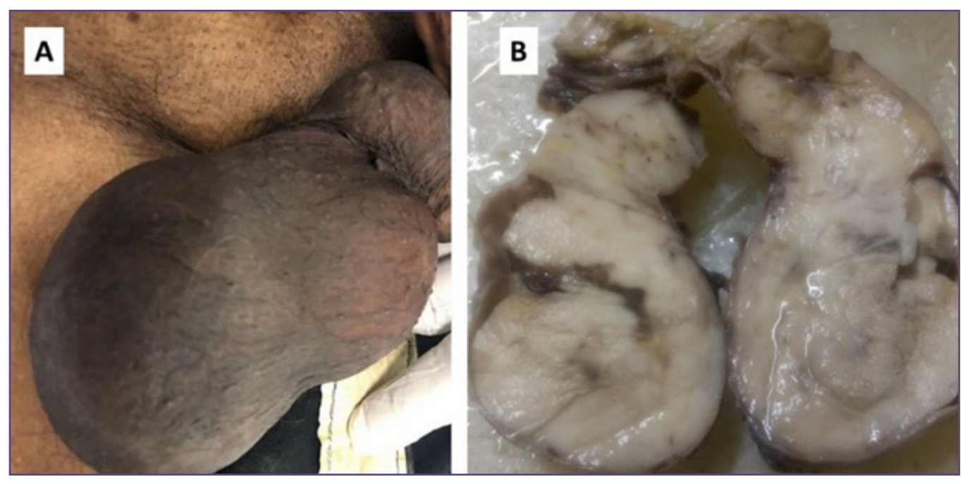
Fig. 1: Unilateral right testicular enlargement in primary testicular lymphoma. 1B: The gross image of the testicular resection showing a homogenous fleshy mass involving the whole of the parenchyma.