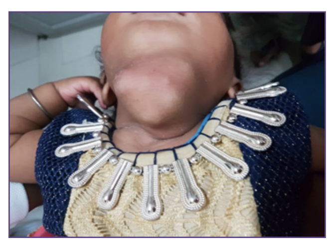
Fig. 1: Patient with anterior cervical teratoma.

The aetiology of cervical teratomas is still confused. These tumors seem to develop randomly for no apparent reason (sporadic). Research is going on to learn about the probable causative factors. The studies have centered around the genetic mutations leading to amplification, 9p22