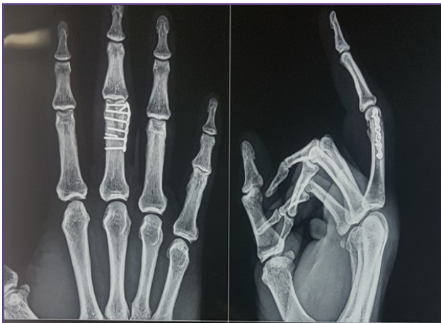
Fig. 2: X ray showing fracture reduction using K wire and screws.