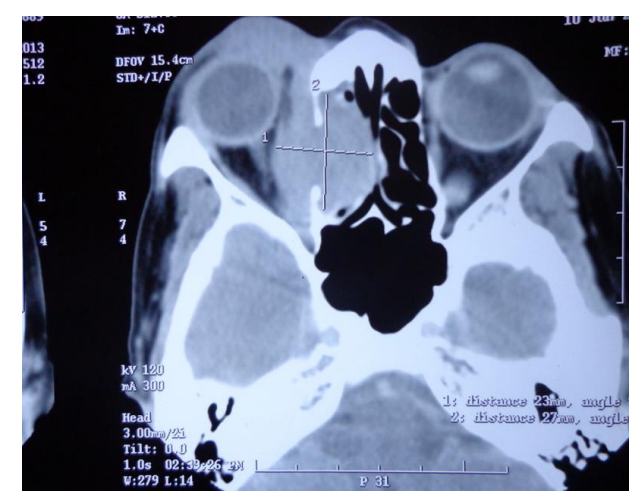
Figure 1 - CT scan showing an orbital mass with ethmoid sinus destruction

1). The patient was referred to Fine needle aspiration (FNA) clinic for cytological diagnosis from the orbital mass.