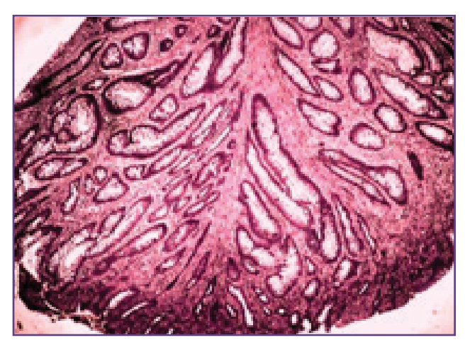
Fig. 3: Photomicrograph showing histopathology of solitary hamartomatous polyp.

Colo-colic intussusception is an unusual cause of large bowel obstruction in children with no studies documenting the exact prevalence of the disease. Its occurrence is mostly associated with a pathological lead point with majority case reports reporting it to be juvenile polyps. However, the polyps varied in size and clinical presentation. Arthur et al reported a case of colocolic intussusception in a three year old child caused by a colonic polyp. [3] A case of CCI in a four year old male secondary to juvenile polyps was reported by Abrahamsetal in 2012. The child came with complaints of worsening vomiting and diarrhea and on exploration was found to have two large intraluminal pedunculated polyps (measuring 3.3 \times 2.5 \times 2.0 cm and 2.2 \times 2.0 \times 1.0 cm) and one small polyp as lead points for CCI.[4] Yamada et al reported CCI in 10 month old boy who presented with bloody stools. Juvenile polyp approximately 15 mm in size was found to be the leading point.<sup>[5]</sup> However, two cases of CCI without pathologic lead points had been reported in a 7-year-old boy in 2008 by Mahmudloo et al and in