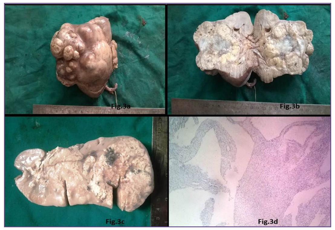
Fig 3: (a) Gross photograph-External surface showed enlarged kidney with bosselated surface and varying size nodules. (b)&(c) RCC- cut surface showed variegated appearance with areas of necrosis and hemorrhage.(d) Multicystic nephroma showed immunopositivity for Pax 8.(d).