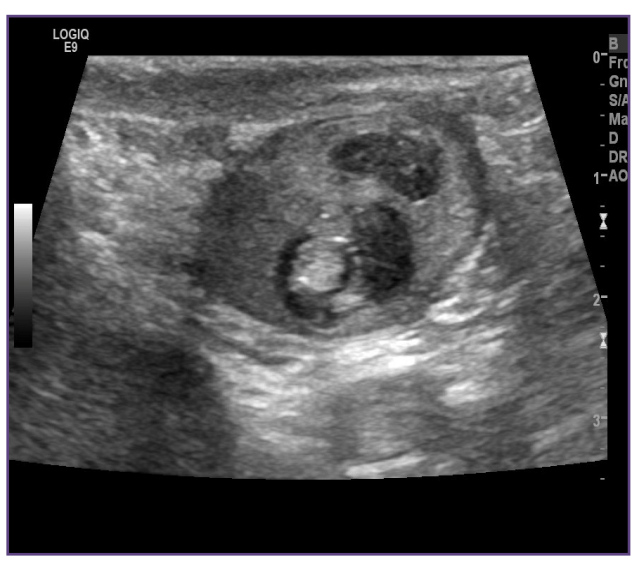
Fig. 2: Sonogram showing a round mass with concentric rings of alternating echogenecity.