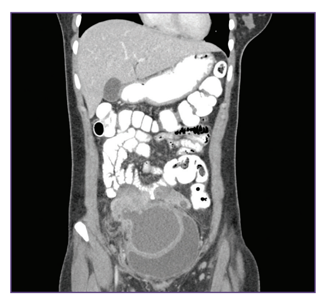
Fig. 1: Computed tomography scan showing a solid cystic right ovarian mass involving and adhering to the right anterior uterine wall, extending anteriorly upto left uterine cornu and involving both sides of uterus.

Pus culture showed growth of Staphylococcus aureus . Cytology revealed degenerated as well as intact polymorphs admixed with few mononuclear cells comprising of plasma cells and macrophages.