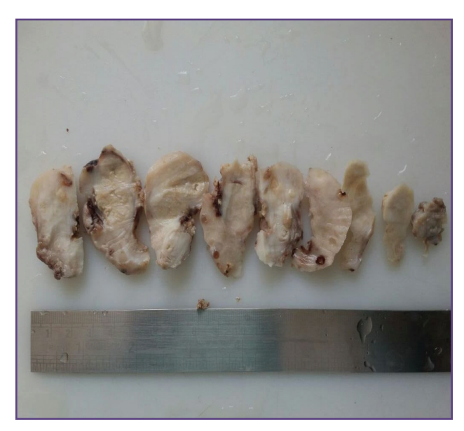
Fig. 2: serial sectioning of the right ovary revealed solid grey white areas with pale yellow patches and cystic spaces.

IMT is a rare benign mesenchymal neoplasm. Proper detailed description of its pathological identity was done in 1954 by Iverson and Umiker, though it was described first by Brunn.<sup>[4]</sup> It often presents in first and second decades of life with slight female predominance.<sup>[1]</sup> Lungs are most