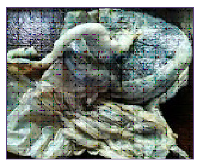
Fig. 1: Shows opaque membrane and centrally placed umbilical cord of placenta in pre-eclampsia.