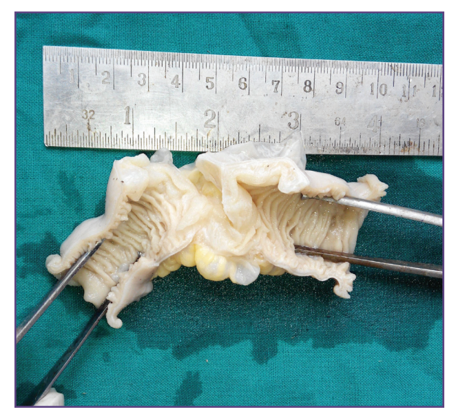
Fig. 1: Cut surface of piece of small bowel showed multiloculated cyst like areas with thinning of intestinal and whitish in appearance.

Based on clinical and histopathological findings confirmed the diagnosis of lymphangiectasia. Patient was started on medium chain triglyceride diet along with high protein diet.