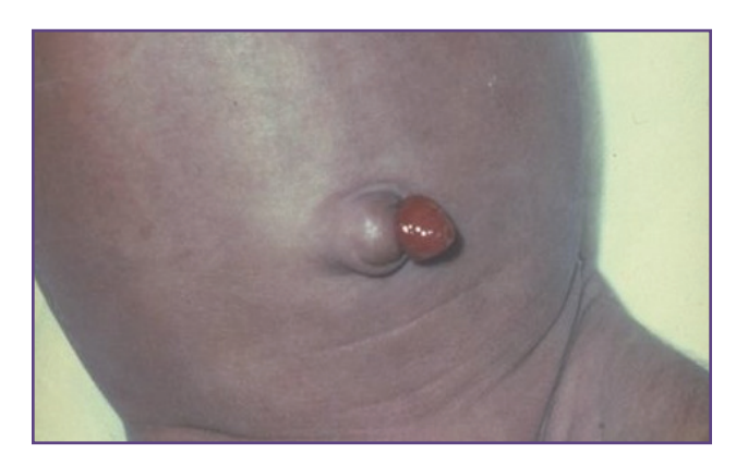
Fig. 1: An umbilical polyp seen as a bright, glistening, cherry red nodule on umbilicus

The differential diagnosis of umbilical polyp includes umbilical granuloma, which is darker red, more apt to bleed, and responsive to silver nitrate cauterization, and also vascular neoplasms, including sarcomas and congenital hemangiomas (Table 1). It also includes a patent urachus, whose presence is confirmed by the passage of urine through the umbilicus. [6] An inadvertently ligated loop of bowel that has herniated into the umbilical cord also may simulate a patent omphalomesenteric fistula, especially when there is an intestinal fistula. [6]