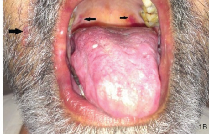
Figure 1A: Showing waxy papules, purpura and ecchymoses in the periorbital region., (1B): Macroglossia with ecchymosis on hard palate (arrow).