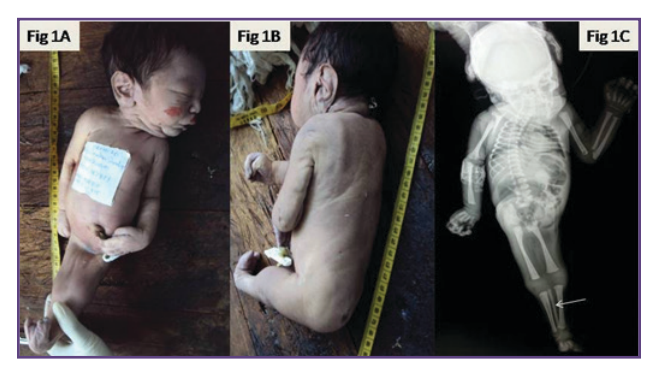
Fig. (1A): Showing fetus with fused lower limbs and large ear., (1B): Showing imperforated anus., (1C) : X ray showing two femur, two tibia and one fibula (white arrow)

Internal examination revealed normal 4 chambered heart. There was patent ductus arteriosus (Fig 2 D). Gastrointestinal