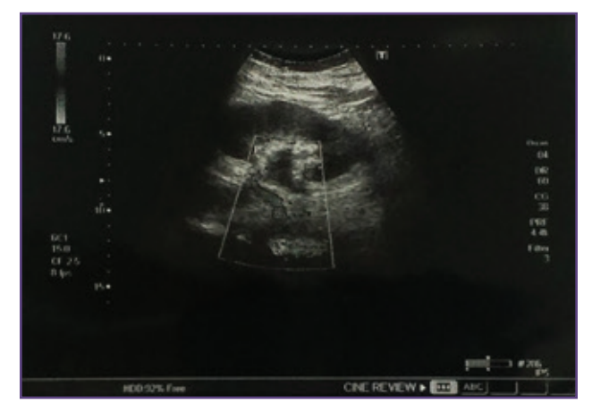
Fig. 1: Right kidney normal in size and shows normal echogenicity. Corticomedullary differentiation is maintained. Renal pelvis is mildly prominent. On color Doppler, renal artery shows normal filling and renal vein shows patchy flow – suggestive of partial obstruction

A renal biopsy was performed. Light microscopy revealed 26 glomeruli all of which were histologically unremarkable. Tubules showed degenerative changes (Figure 2). On immunoflourescence granular IgG deposits were noted along the glomerular capillary loops, compatible with the diagnosis of Early Membranous Nephropathy. (Figure 3).