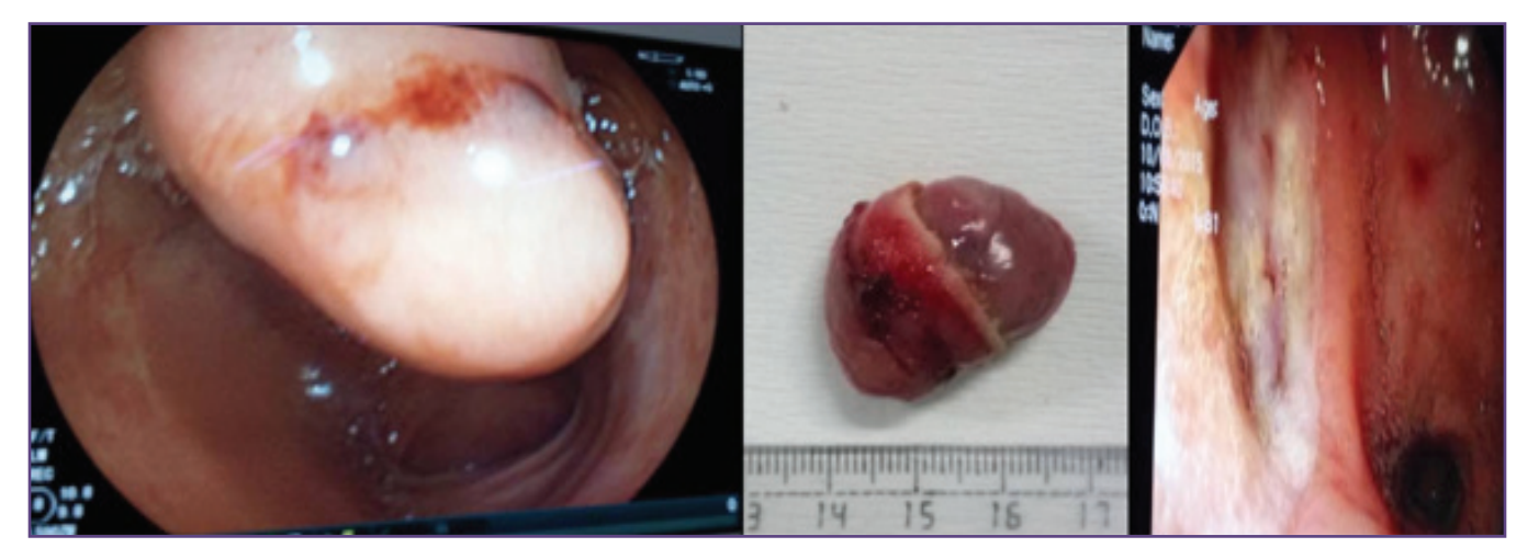
Fig. 1: Endoscopic photomicrographs of case 1. a: showing a polyp with focal surface ulceration, b: Gross image of polyp measuring 3 cm, c: post-operative day 3 image showing healing ulcer with clean base.